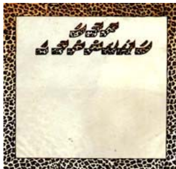
The front of the sleeve -

A colour illustration based on this b/w version was to be framed by the border.