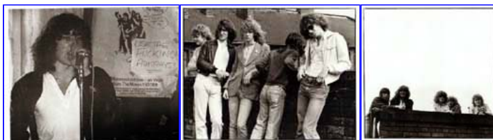
Pics from the same session - as featured on the recent VH1 Special

Def Leppard were preparing a follow up to their first record on their own label, Bludgeon Riffola. The EP had gone into a second pressing and the pressure was on to get another single out. There was a real possibility the band might be signed by a major label, but true to the punk spirit that had inspired them to release the EP, the plan was to get something out anyway. If the majors wanted a piece they knew what to do.